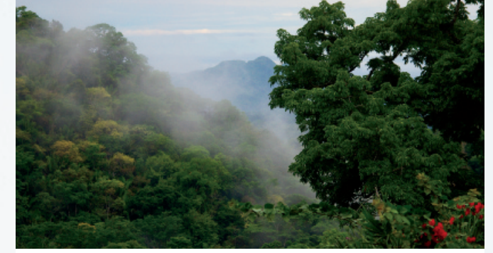
Maya Mountain Marine Corridor, Toledo District, Southern Belize

QLF promotes community-based approaches to conservation that directly engage local residents, community organizations, and governments. Our strong support of locally-based initiatives, backed by public outreach and education, has been recognized globally as a model for achieving long-term conservation goals.